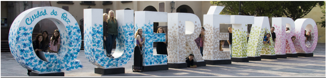
Photos from Wheaton in Mexico, Spring 2016