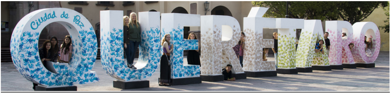
Photos from Wheaton in Mexico, Spring 2016